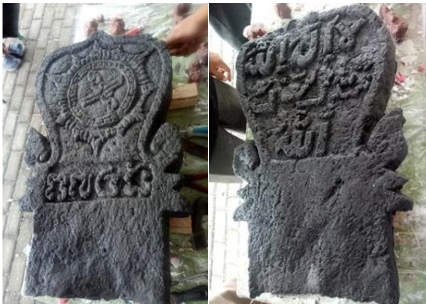
Figure 12. The cast gravestone.

needs dye so the basic color of the rock stands out, fiber and refining touch.