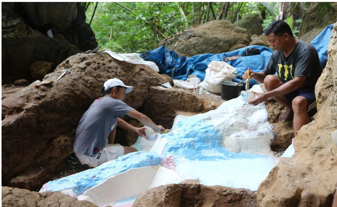
Appendix 1. Photo of casting activities for the discovery of human skeletons at the Leang Jarie Site