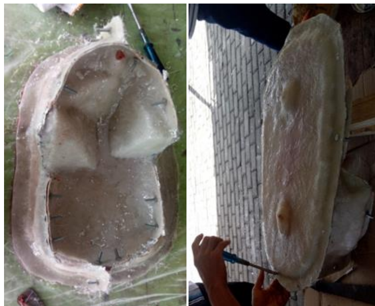
Figure 9. Images indicating negative mold made of resin and fiber augmented with bolts.

Prepare a mix of resin powder and catalyst to create a layer covering silicon rubber on the negative mold. The allocated time being due, coat it with fiber. Add another layer of resin mix without having any space left. When the fiber layer gets dried, remove the plasticine and put aluminium foil on it. Again, put on some