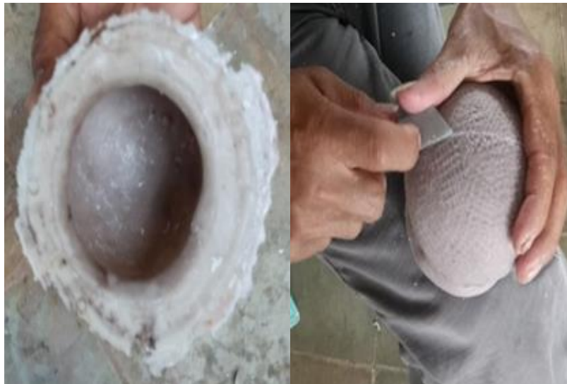
Figure 7. On the left is the flipper-like part of the mold and the right one is the method taken to remove it

stick to it. Another mix is added on to cover the attached gauze to further upgrade the strength of the negative mold. Remove all those added layers. When done, prepare another footing and a partition to support the gypsum, the latter being the pillar to prevent the negative mold from sudden move. Gypsum sizing depends on the scale of the container to secure. Put the gypsum into the water and make sure it is not extremely dissolved so as to prevent it from melting.