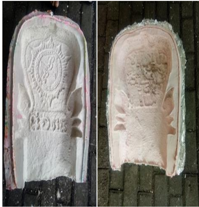
Figure 10. The two sides of negative molds for gravestone casting.

vaseline and the mix of resin, powder and catalyst. When it has reached the desired texture, correct it from all the flaws and fasten it with bolts. All those steps done, flip it to move on to the second part of the negative mold. Remove the plasticine where the furnace stands, put plasticine on the fiber, vaseline and another layer of rubber and then two cotton balls covered with silicon rubber as fastening mechanism. Remove plasticine on the fibered surface and put on aluminium foil, vaseline and resin mix. After that, place another layer of resin on it, to be bolted later. On the other hand, a mix of resin is also prepared, for positive mold. Pour the mix into the negative mold, to be stirred to have a well-blended mix, and let it reach the desired texture.