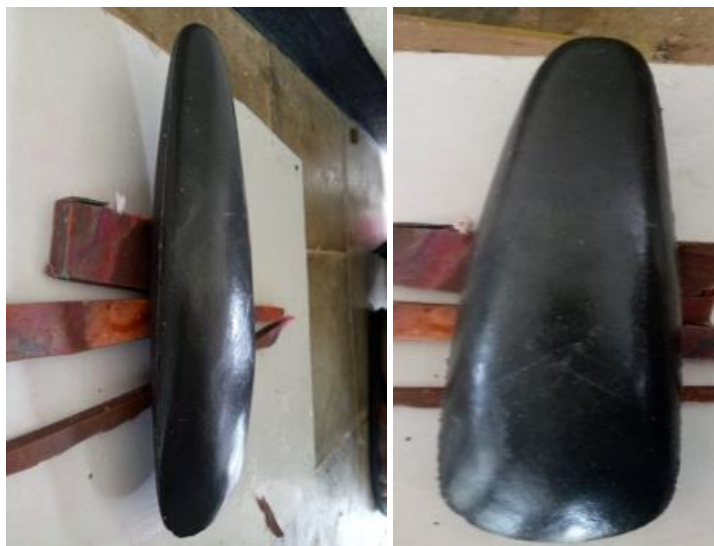
Figure 4. Left side is positive mold indicating joint; the right is superior view or the surface of the oval axe

the proportion of 100 mL + 3.5 mL. Stir it well and pour it into the stone artefact and wait until it gets solidified. After that, remove the plasticine and clean the stone. Next, make another peripheral border on the