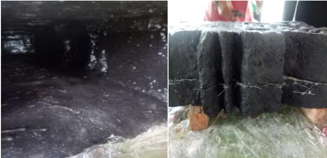
Figure 11. On the left is resin mix placing on the positive molds joint; unnecessary parts from the joining process.