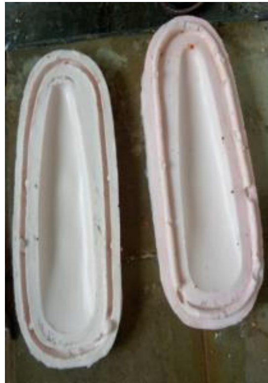
Figure 3. The Negative Mold of Oval Axe

It takes two negative molds to produce an hand adze (figure 3 and 4). First, prepare the artefact and the base to which it is later placed, from plasticine. The plasticine covers half of the stone without any hole to prevent unnecessary part from forming. Make a peripheral groove as the fastener and so is a peripheral border to secure the mix when the casting starts. Apply vaselin and plasticine to the whole surface. Mix silicon rubber and catalyst with