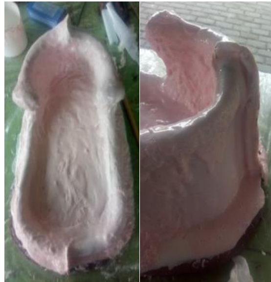
Figure 8. The making of negative mold; the fastened mold on the right (Source: Lenrawati, 2018).

To begin with, shoe furnace is partitioned on the upper part and the lower part; the latter is prepared as the aperture for casting purpose (Figure 8 and 9). After that, it is covered with silicon rubber and later with vasetin. Also attached to the whole surface of the furnace is gauze. Another layer of rubber is added on top. Once fully solidified, the rubber is removed and is polished. Vasetin is applied to both upper (head) and lower (feet) parts. Mildly drying rubber is covered with gauze with gentle pressure and recovered with silicon rubber. The rubber on the upper is cleaned and given vasetin before being augmented with gypsum on three upper side covered with aluminium foil. Gypsum being wrapped by aluminium foil, make another layer (barrier) of plasticine on the rim or mouth of the furnace and add another layer. At the end, rub vasetin to the whole silicone rubber and aluminium foil including plasticine layer.