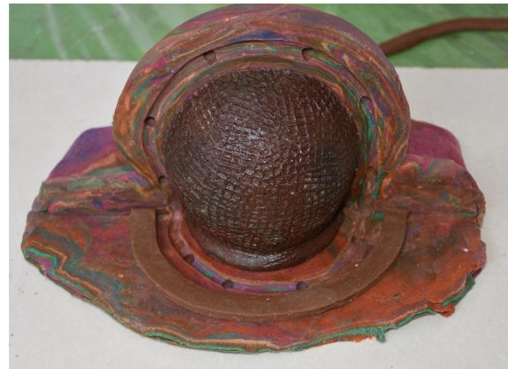
Figure 5. Jar on a footing, with divided areas from plasticine (Source: Lenrawati, 2018).

As regards jar, it takes three pieces of negative mold to come up with a positive mold (Figure 5, 6 and 7). All materials being ready, the first and foremost step is to prepare a footing on the wood plank. Prepare