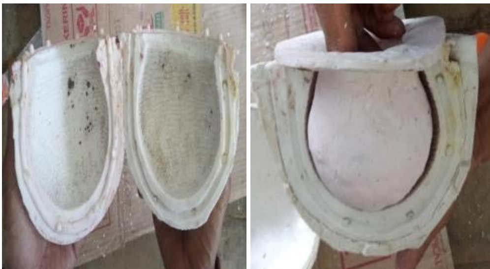
Figure 6. The three sides of the negative molds of the jar

Prepare a border on the jar, at the exact half. Then add small groove with some holes as fasteners. Then indicate a separation near the groove. Mix silicon rubber of 100 mL with a catalyst of 3.5 mL (in case 200 mL of silicone rubber, then the catalyst should be two times that of the normal, 7mL). After that, apply the mix to the jar evenly to generate the first part of the mold. Cut of some gauze and attach it to the silicon rubber. It strengthening the mix, press the gauze to the mix using brush for it to better