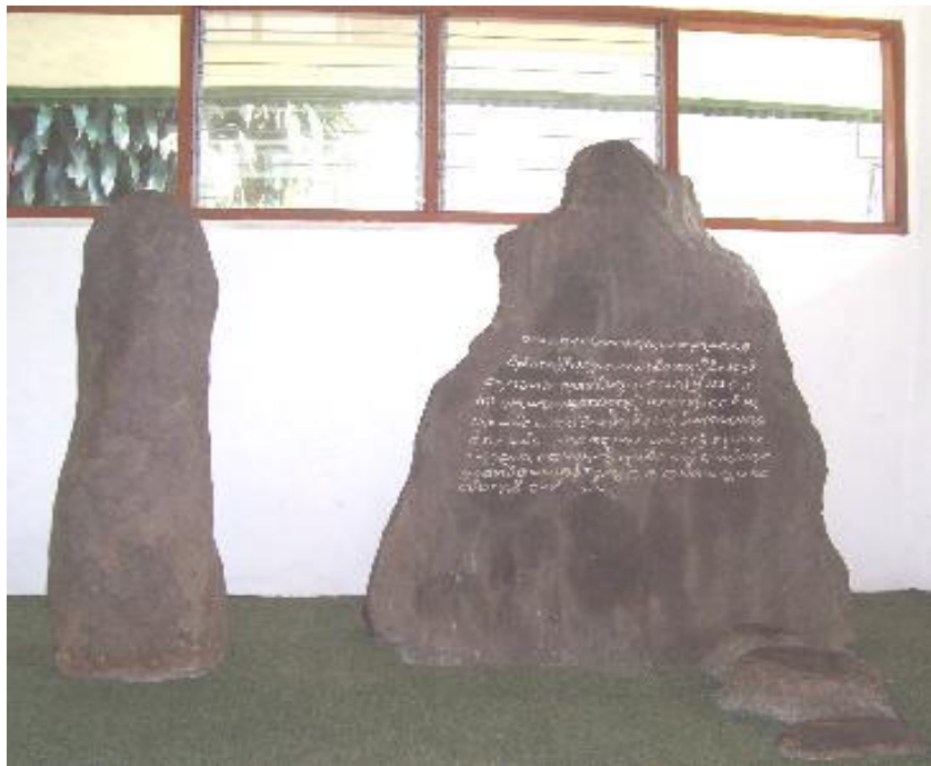
Figur 8. Prasasti Batutulis at Kelurahan Batu Tulis, Kecamatan Bogor Selatan, Kota Bogor.

Paku Alam and Paku Buawana . The word Pakuan is parallel in meaning to Maharaja (emperor), making it in the same stature as that of Majapahit. To add to the already strong claim, the script of Carita Waruga Guru suggested that Pakuan Pajajaran is strongly linked with the local fern ( paku ).