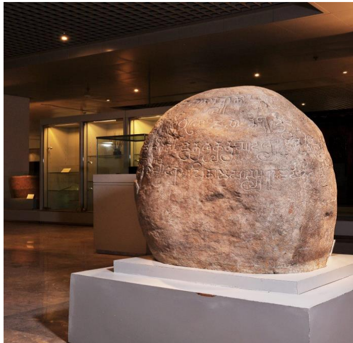
Figure 2. The Tugu Inscription at the National Museum.

The word Tarumanegara was derived from a plant name tarum , a Sundanese for indigo plant (Nicolaas, 1931, p. 29). Later publications are of the same opinion: Hardjadibrata and Sijthoff in Wessing (2011). On the other hand, Rosidi (2000) holds on to a conviction that the label comes from Citarum River. Despite the controversy, the naming follows the general practice where it is either taken from flora or fauna nearby. An example would be Majapahit; consisting of the plant “maja” and the taste “pahit”, the two words finally give birth to Majapahit (Knappert, 1977).