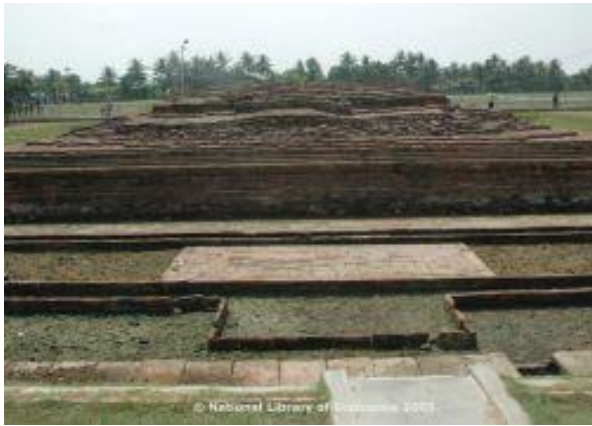
Figure 3. Jiwa, another Buddhist temple, at Batujaya Complex of Karawang.

translate the inscription (Widyastuti, 2013, p. 144), which goes: