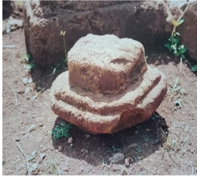
Figure 5. The peak of Bojongmenje Temple.

indicates being outside. The inscription was made to mark a foreign trip Sumadio (1990, pp. 58–59). Moreover, the successful expedition to a new territory led up to the creation of the inscription (Boechari, 1986, pp. 33–56). Latest report on that matter highly points to Bhūmi Jawa being a persistent kingdom in seventh-century Java, which is Tarumanegara (Saptono, 2012).