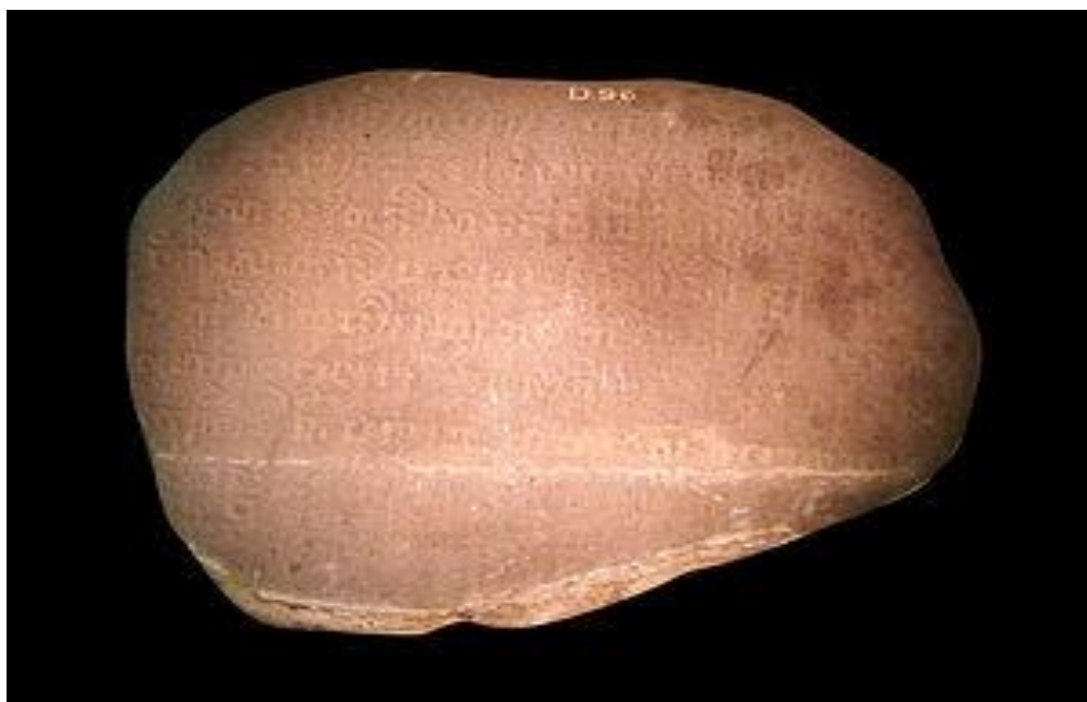
Figure 7. Jawa Incription in Citatih, or famously known as Sanghyang Tapak, engraved in Kawi script and Old Sundanese (Source: Museum Nasional Indonesia, 2020).

Given the three components manifested in Banteng Girang rich culture, anomaly can be discerned when considering the investigations conducted by Guillot in Munoz (2009), pertaining to " Sunda " to be exact. In an inscription found in Central