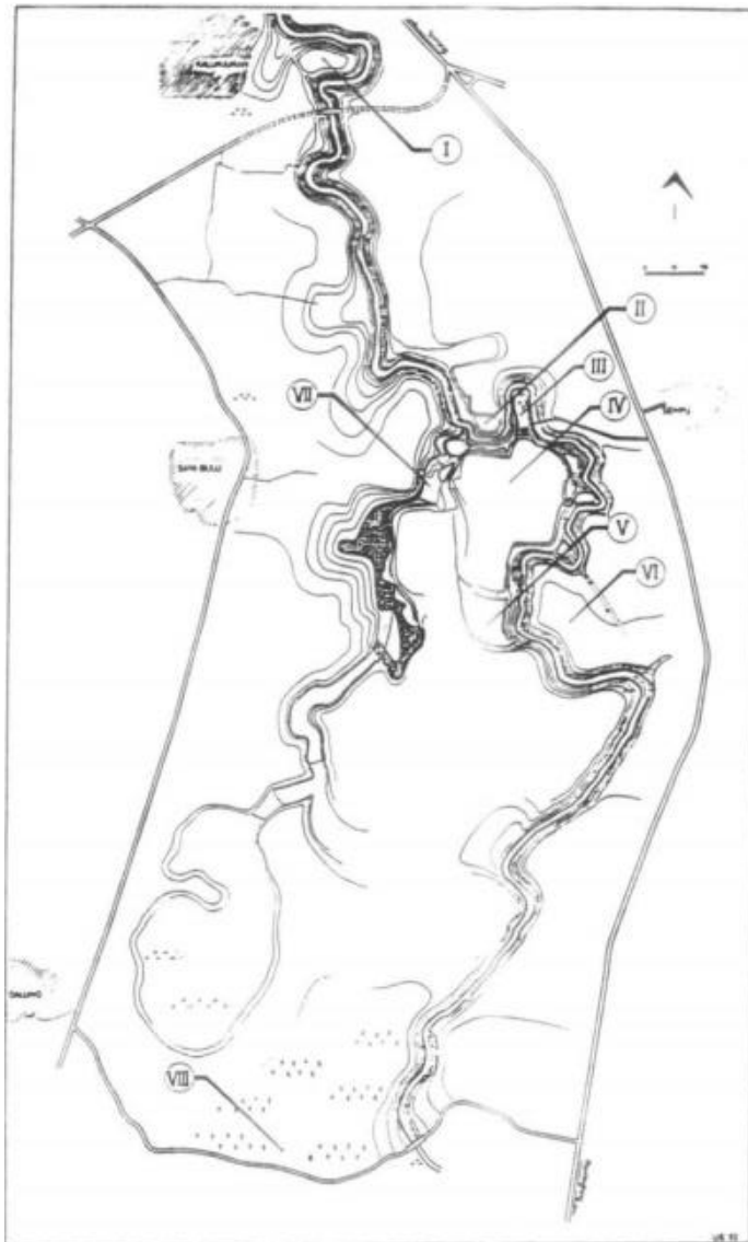
Figure 6. Banten Girang and its surrounding I. Kalunjukan; II. Asem Reges; III. Banten Girang; IV-V. Telaya; VI. Banusri; VII. Pandaringan; VIII. Alas Dawa.

The conclusion being drawn thus far, saying that Bandung was a rural area when being invaded by Sriwijaya was affirmed by the inscribed texts in Prasasti Tugu. Tugu