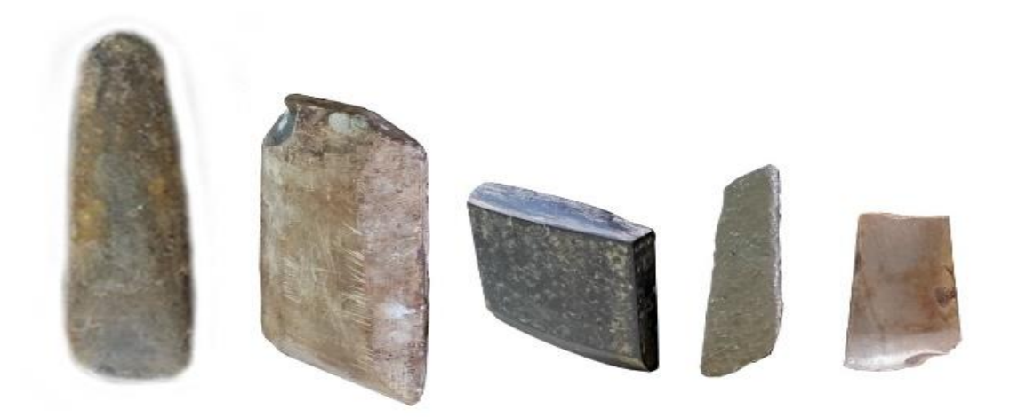
Figure 2. Pickaxes recovered from Bawean

and the second one is Gua Kalak Barat in Sampang Regency. A test conducted in a pit recovered earthernware sherds and animal bone fragments ( macaca fascicularis ). To date, unfortunately, there has not been enough information in regard to chronological contexts of the two (Gunadi, 2019).