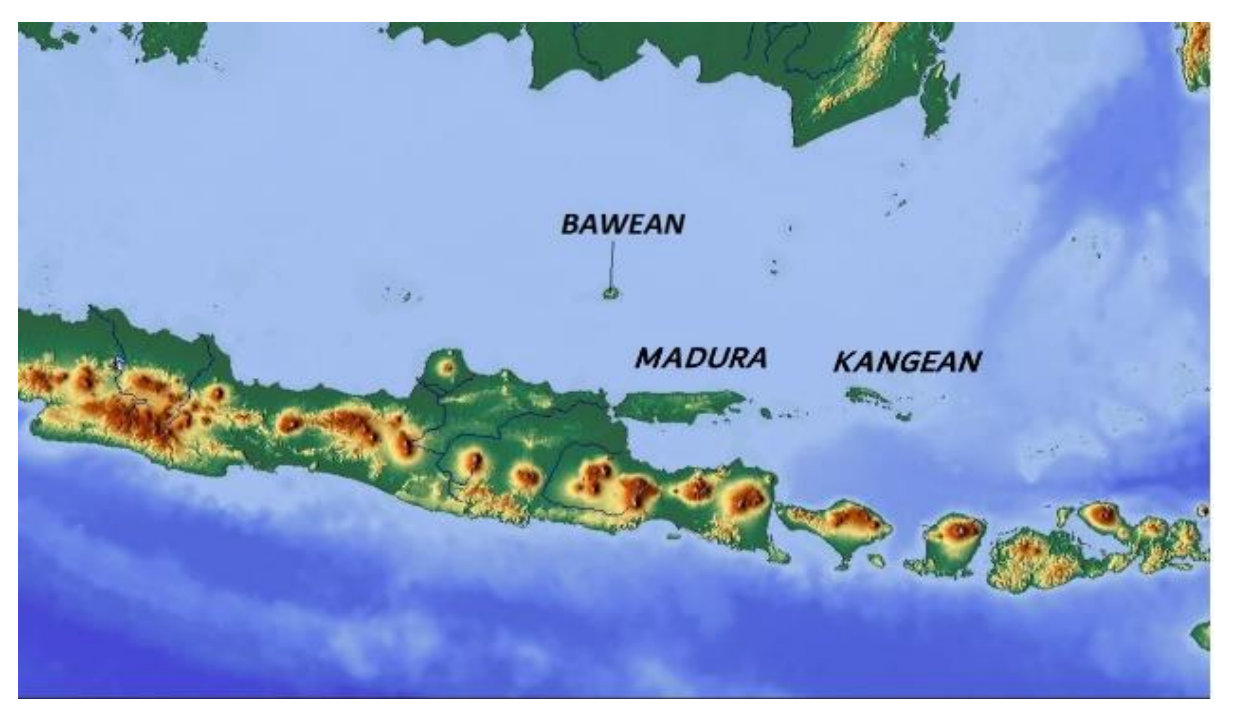
Figure 1 : Bawean, Madura and Kangean Island in the North Java Sea.

Prehistoric traits are definitely apparent in the area, being the center of migration waves by means of sailing. It is even more interesting to ponder the extent those islands had played in prehistoric Indonesia, particularly in the areas nearby.