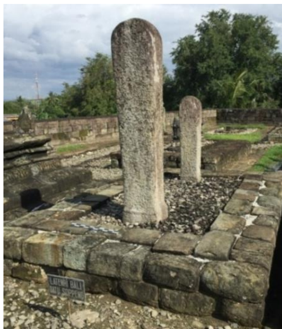
Figure 4. The tomb of La Tenri Bali, King Soppeng XV (Source: Muhammad Nur, 2018).