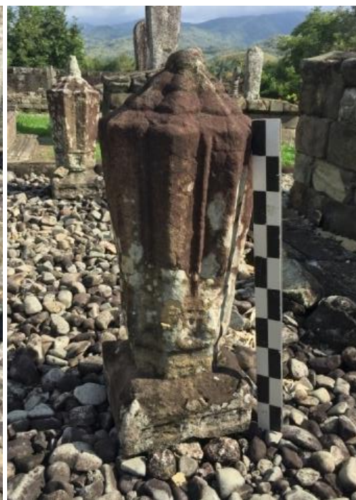
Figure 9. bearing two Aceh K gravestones