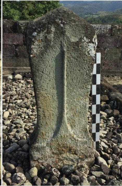
Figure 11. A feature of Bugis gravestone

and Lapatau Matanna Tikka in Naga Uleng also used this type. Sword type essentially reflected that the individuals buried were brave warriors. Our investigations confirmed that Soppeng was the leader in bearing this kind of gravestone; Soppeng was like a trend setter, a kingdom with a far-ranging influence. All doubts are cleared out