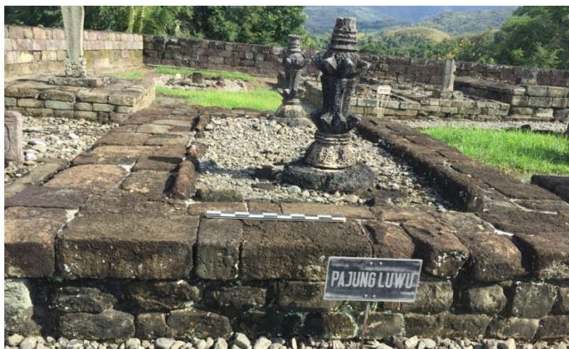
Figure 12. The Pajung Luwu tomb with two crown-type gravestones. The gravestones were made of limestone while the tomb, andesite stone (Source: Muhammad Nur, 2018).

The tombs of Sidenreng and Luwu (Figure 12) have a lot of information about Soppeng Kingdom. The originally non-inscribed tombs got identified thanks to conservation effort taken in 1980. The two tombs were Addatuang Sidenreng and