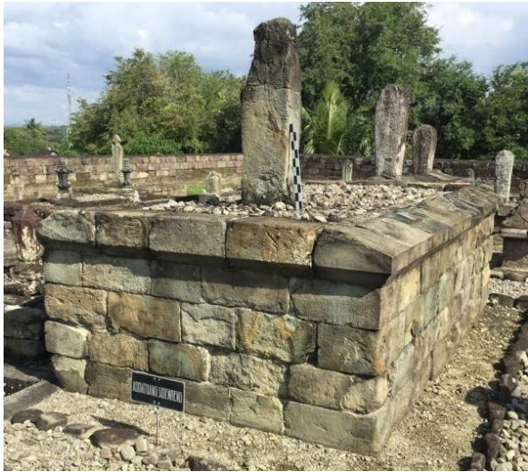
Figure 5. The Tomb of King Luwu