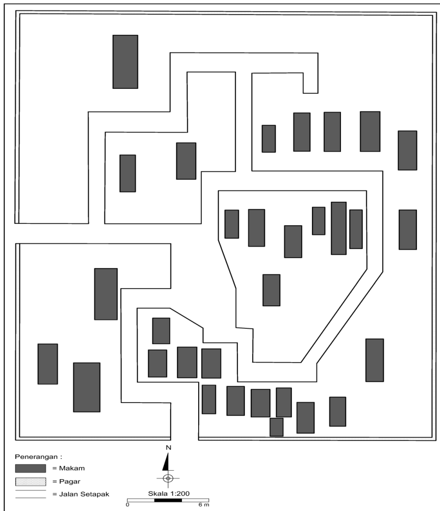
Figure 2. The tombs sketch of Jera Lompoe.

The decorative motifs of the gravestones include geometric (curved, triangular, cross and perpendicular), leaf tendril, flowers and calligraphy. The calligraphy inscriptions bear the names of Allah and Muhammad. A conclusion worth