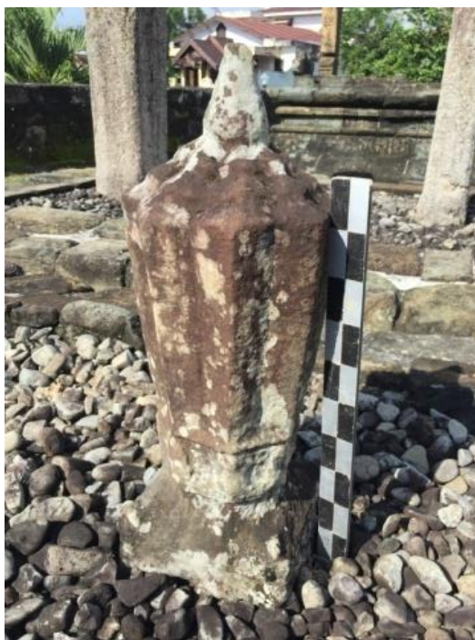
Figure 8. The tomb of We Tenri Kawareng

The nine sword-type gravestones are the dominant type found at Jera Lompoe (Figure 10 and 11). It is closely associated to Bugis, with the locations of its initial development being in Bone, Soppeng, and Wajo, which began to be used in 17th to 19th centuries (Rosmawati, 2013). We can find that type of gravestone at such complexes as Gowa, Tallo, Naga Uleng, Lamuru, and Tanete (Barru). The graves of prominent kings such as Larumpang Megga (Tanete)