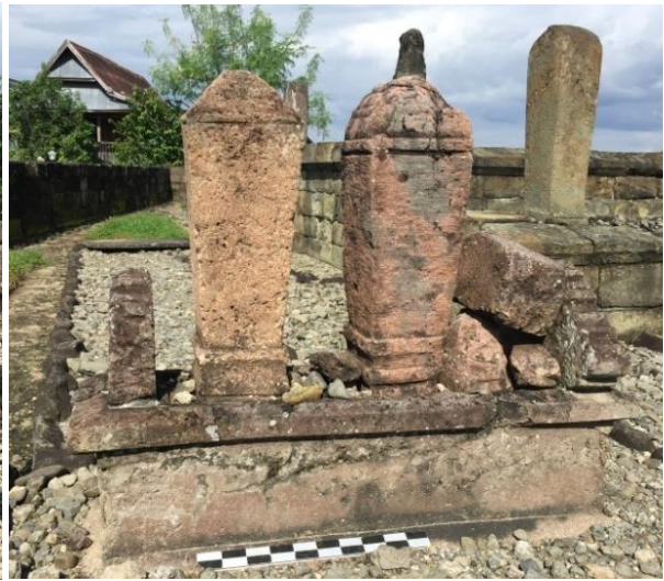
Figure 6. The Tomb of Datu Mari-Mari

chiseled menhir gravestone (Figure 4). La Tenri Bali was Datu Soppeng XV (King), sitting on the throne from 1659 to 1676 (Mappangara, 2004, p. 294) who had the honorary title Matinroe ri Datunna