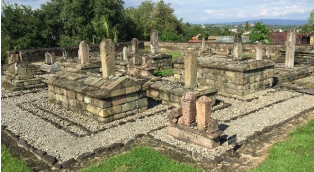
Figure 3. The tomb site of Jera Lompoe

drawing thus far is Neolithic culture is so apparent in the form of menhir-like gravestones (Duli & Nur, 2016). Nearby, we get to see the remains of ancient Soppeng Kingdom like stone mortar, bracelet meeting, dakon (perforated) stone and stone altar, demonstrating that the area, apart from being a burial site, was also used as large-scale core settlement, supported by the