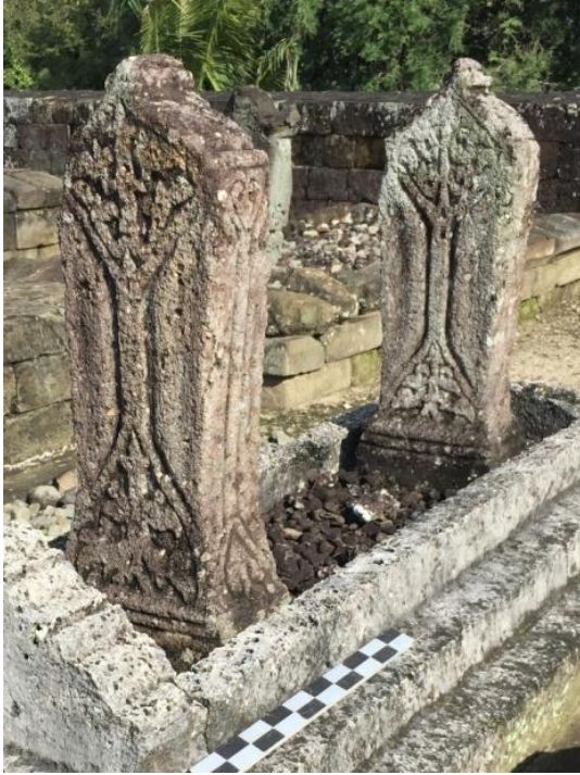
Figure 10. Sword type gravestone