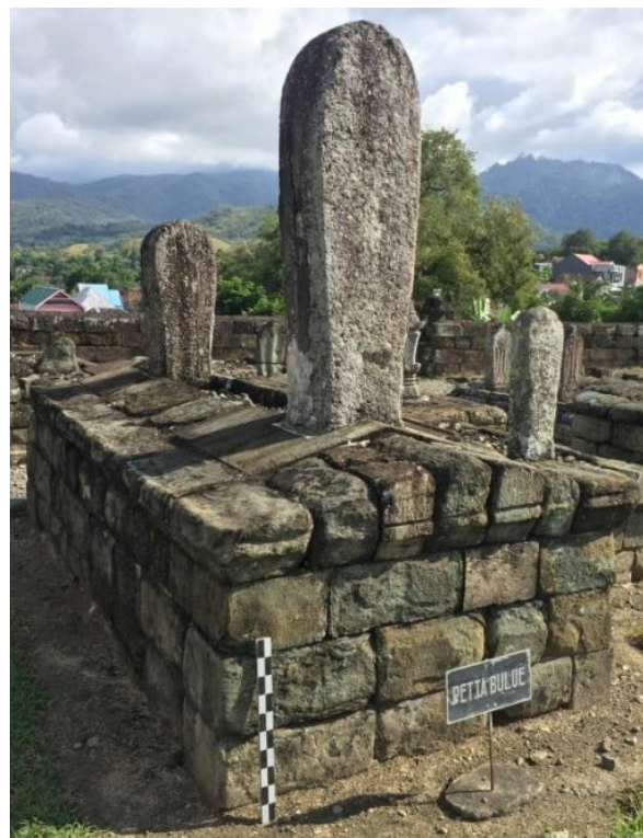
Figure 7. Petta Bulue Tomb