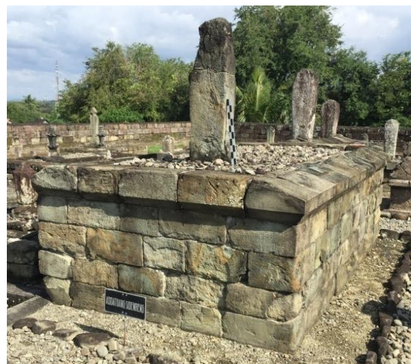
Figure 5. The Tomb of King Luwu

chiseled menhir gravestone (Figure 4). La Tenri Bali was Datu Soppeng XV (King), sitting on the throne from 1659 to 1676 (Mappangara, 2004, p. 294) who had the honorary title Matinroe ri Datunna