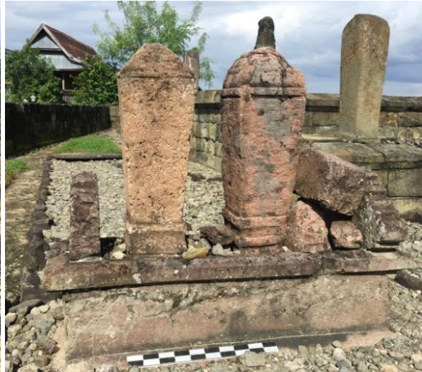
Figure 6. The Tomb of Datu Mari-Mari

chiseled menhir gravestone (Figure 4). La Tenri Bali was Datu Soppeng XV (King), sitting on the throne from 1659 to 1676 (Mappangara, 2004, p. 294) who had the honorary title Matinroe ri Datunna