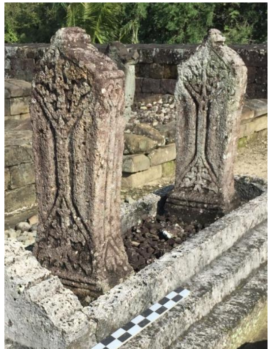
Figure 10 . Sword type gravestone

and Lapatau Matanna Tikka in Naga Uleng also used this type. Sword type essentially reflected that the individuals buried were brave warriors. Our investigations confirmed that Soppeng was the leader in bearing this kind of gravestone; Soppeng was like a trend setter, a kingdom with a farranging influence. All doubts are cleared out