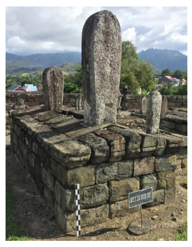
Figure 7. Petta Bulue Tomb

We Adang tomb is three-tiered one, made of andesite stone planks. The top level is decorated with a leaf vine, with a sword type gravestone. He was the King Soppeng XVI, also known as Datu Madello and Datu Watu.