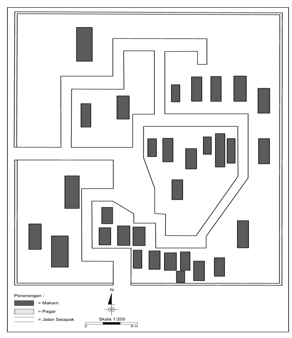
Figure 2. The tombs sketch of Jera Lompoe (Source: Rosmawati, 2013).

The decorative motifs of the gravestones include geometric (curved, triangular, cross and perpendicular), leaf tendril, flowers and calligraphy. calligraphy inscriptions bear the names of Allah and Muhammad. A conclusion worth