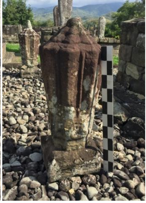
Figure 9. bearing two Aceh K gravestones