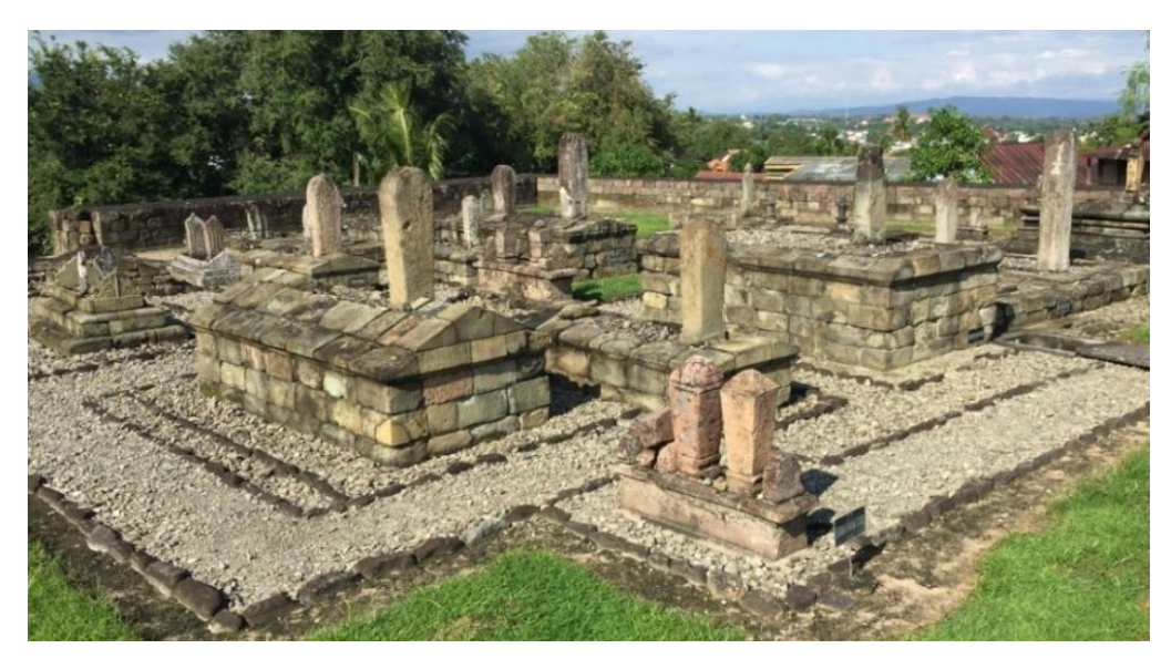
Figure 3. The tomb site of Jera Lompoe

drawing thus far is Neolithic culture is so apparent in the form of menhir-like gravestones (Duli & Nur, 2016). Nearby, we get to see the remains of ancient Soppeng Kingdom like stone mortar, bracelet meeting, dakon (perforated) stone and stone altar, demonstrating that the area, apart from being a burial site, was also used as large-scale core settlement, supported by the