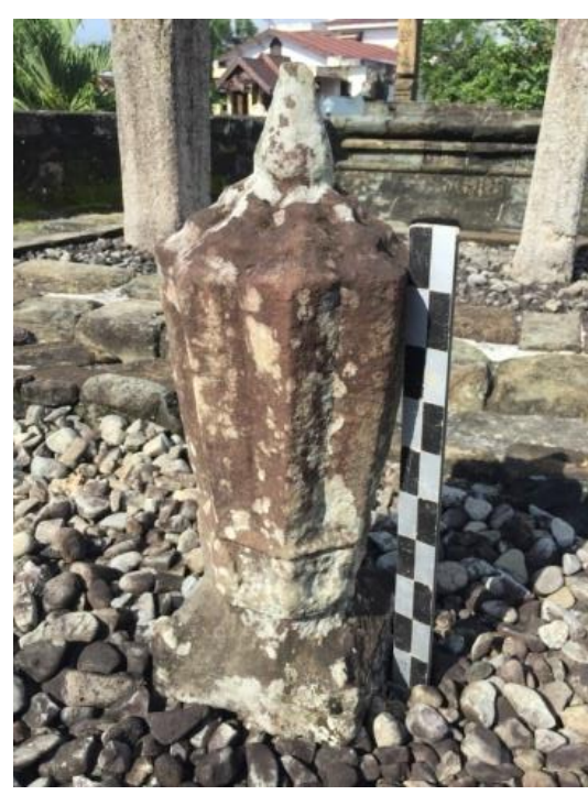
Figure 8. The tomb of We Tenri Kawareng

The nine sword-type gravestones are the dominant type found at Jera Lompoe (Figure 10 and 11). It is closely associated to Bugis, with the locations of its initial development being in Bone, Soppeng, and Wajo, which began to be used in 17th to 19th centuries (Rosmawati, 2013). We can find that type of gravestone at such complexes as Gowa, Tallo, Naga Uleng, Lamuru, and Tanete (Barru). The graves of prominent kings such as Larumpang Megga (Tanete)