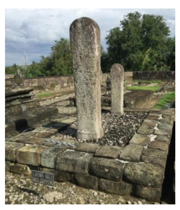
Figure 4. The tomb of La Tenri Bali, King Soppeng XV.

• La Tenri Bali's, bearing a single step tomb made of andesite plank, with