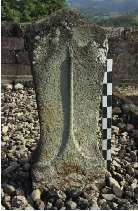
Figure 11 . A feature of Bugis gravestone

and Lapatau Matanna Tikka in Naga Uleng also used this type. Sword type essentially reflected that the individuals buried were brave warriors. Our investigations confirmed that Soppeng was the leader in bearing this kind of gravestone; Soppeng was like a trend setter, a kingdom with a farranging influence. All doubts are cleared out