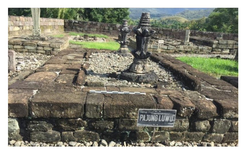
Figure 12 . The Pajung Luwu tomb with two crown-type gravestones. The gravestones were made of limestone while the tomb, andesite stone.

The tombs of Sidenreng and Luwu (Figure 12) have a lot of information about Soppeng Kingdom. The originally non-inscribed tombs got identified thanks to conservation effort taken in 1980. The two tombs were Addatuang Sidenreng and