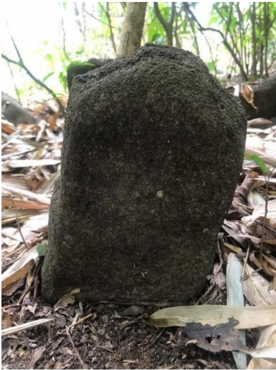
Figure 23. Statue Tombstone 3 in Matakko Islamic Tomb Complex