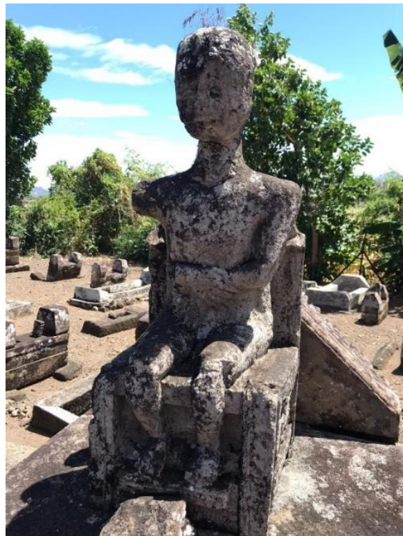
Figure 15. Statue Tombstone 2 in Joko Tomb Complex

Joko who embraced Islam (Kementerian Pendidikan dan Kebudayaan Balai Pelestarian Peninggalan Purbakala, 2012,