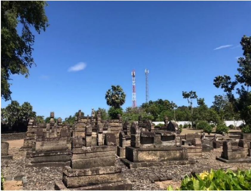
Figure 11. The Complex of the Tombs of Binamu Kings