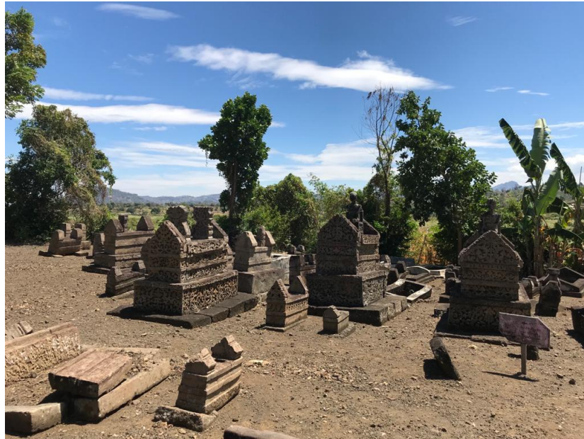
Figure 13. Joko Tomb Complex