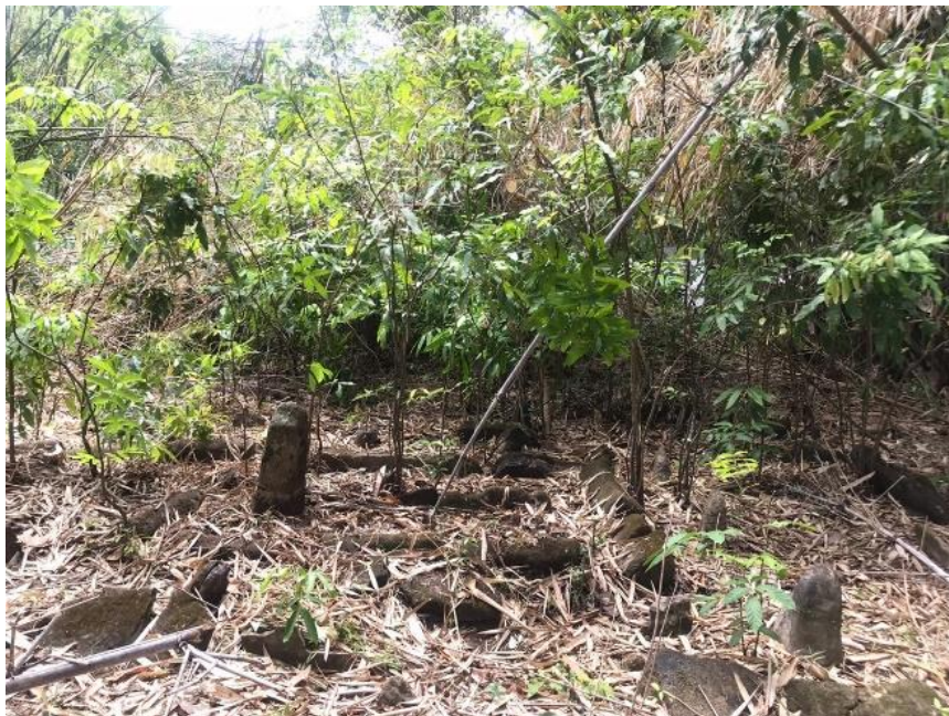
Figure 20. Matakko Islamic Tomb Complex

Matakko Islamic Tomb Complex is situated at the coordinates of 5° 1' 21" South Latitude and 119° 30' 52" East Longitude in Kampung (a kind of hamlet) Bonto Biraeng, Bontomanai Village, Marusu Sub-district, Maros Regency. Located behind a community settlement, the tomb complex is a living site, which means that today it is still