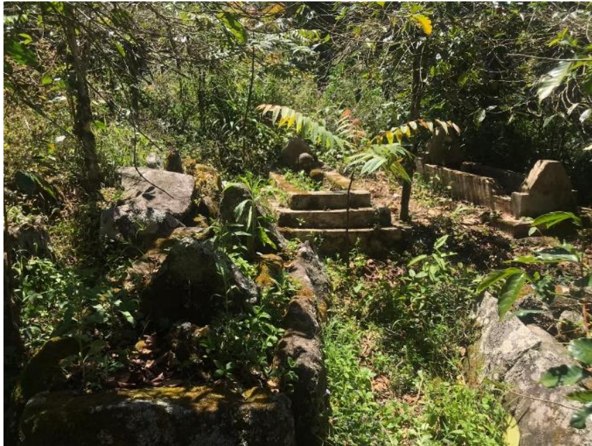
Figure 9. Lanynying Tomb Complex