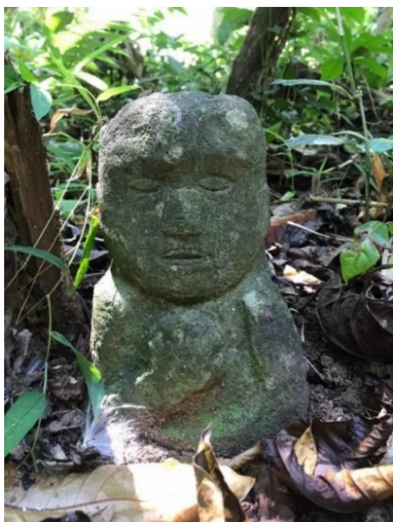
Figure 8. The Statue Tombstone in Lampporo Site

Bantaeng Regency. This old tomb site is situated in the middle of a plantation area owned by villagers at the coordinates of 5° 28' 23" South Latitude and 119° 55' 1" East