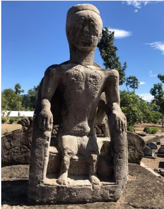
Figure 12. The Statue Tombstone in the Complex of the Tombs of Binamu Kings (Source: Purnamasari, 2020)

(skull cap) and sitting on a throne, an official chair for a ruler. The throne has flora motifs with blooming flowers, tendrils, and stylized leaves on the left and right parts, as well as the back part.