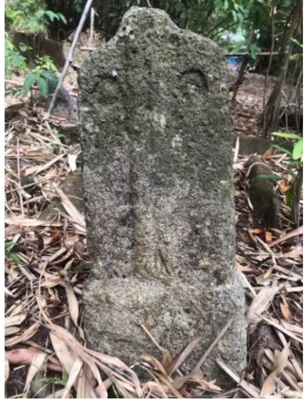
Figure 22. Statue Tombstone 2 in Matakko Islamic Tomb Complex

used as a public cemetery. The tomb complex is full of bamboo trees and wild shrubs (Figure 20).