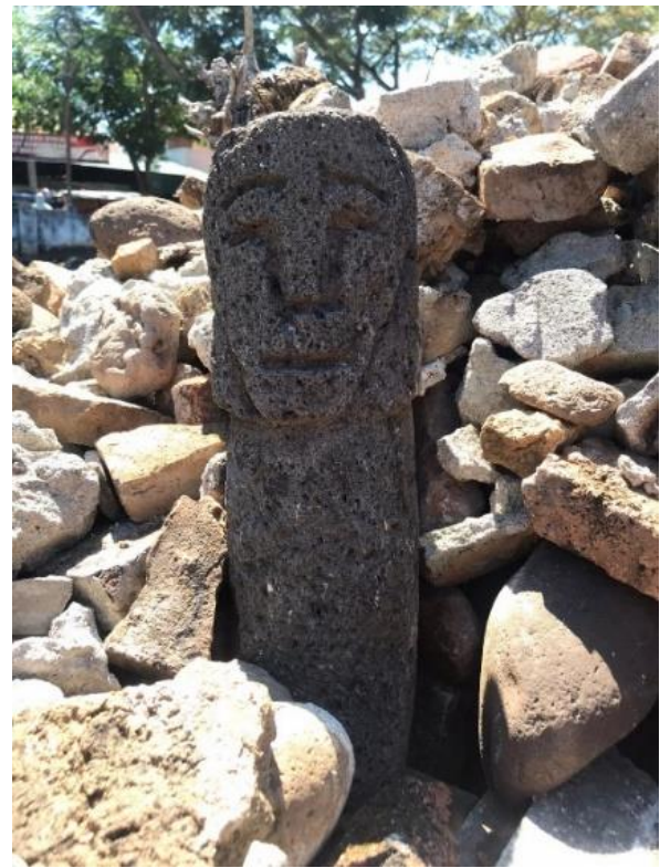
Figure 5. Oval Statue Tombstone in La Tenri Ruwa Tomb Complex