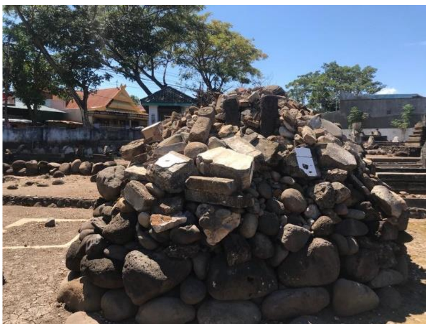
Figure 3. Position of the Statue Tombstones

family. Results of a research conducted by the Archaeological Center of South Sulawesi in 2017 show that there are 250 tombs in the area. 87 of them are old tombs and 163 of them are new tombs (Makmur, 2017, pp. 16–17). In addition, according to some data collected from an oral history, the 7 th King