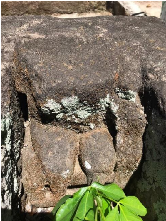
Figure 17. The Statue Tombstone in Makam Syekh ri Poko Bulu Tomb Complex

The statue tombstone found in the tomb complex is smaller than the ones found in the Complex of the Tombs of Binamu