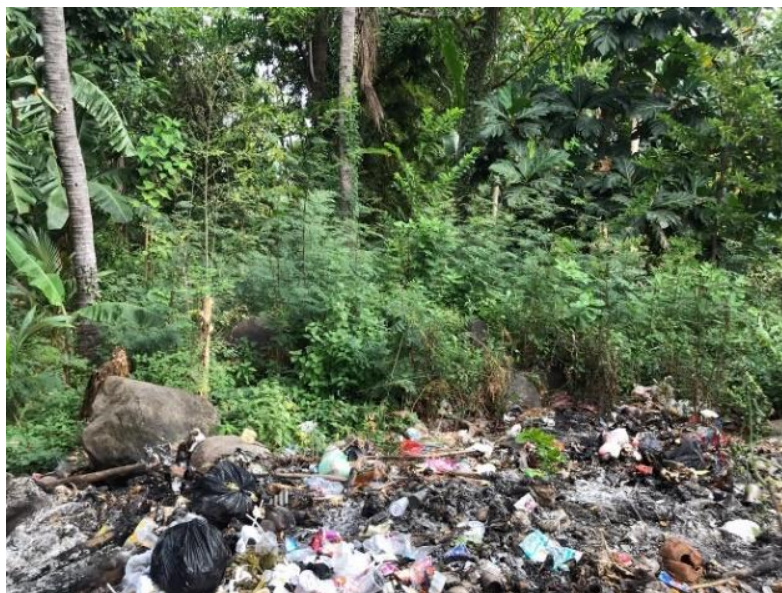
Figure 18. Karaeng Sengge Tomb Complex

The statue tombstone in the tomb complex is in the middle of wild shrubs. It belongs to the tomb of Karaeng Sengge (Figure 18). Karaeng Sengge was a son of Daeng Mappasang who served as Tima Lompo or Tumailalang (a kind of main minister) whose task was enforcing laws.