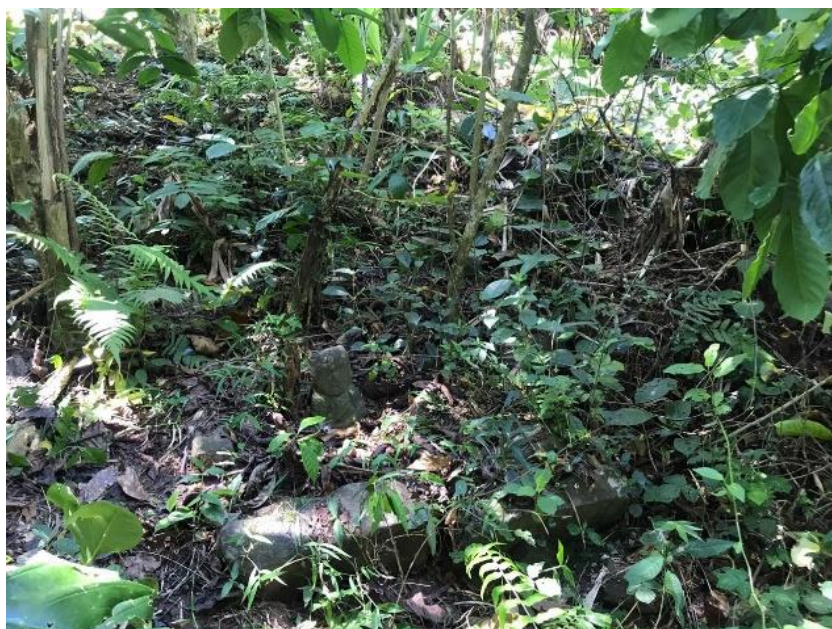
Figure 7. Lampporo Tomb Complex