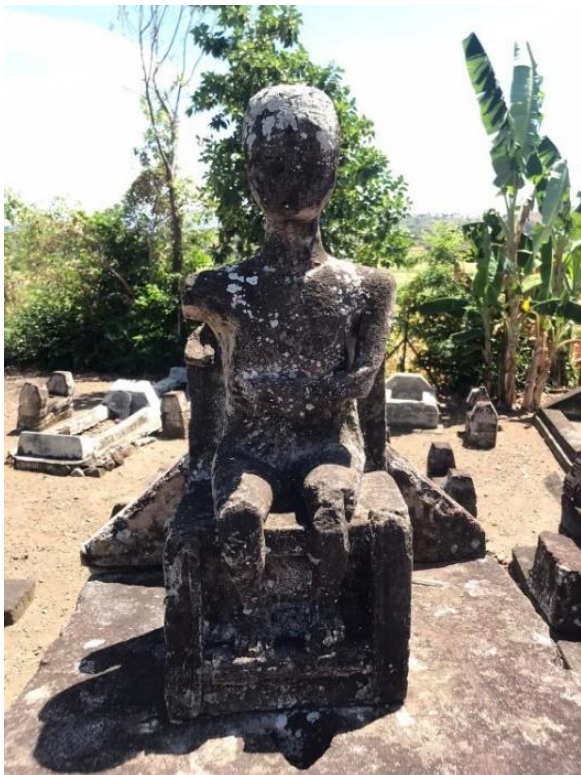
Figure 14. Statue Tombstone 1 in Joko Tomb Complex