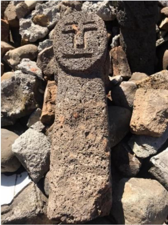
Source 4. Round Statue Tombstone in La Tenri Ruwa Tomb Complex