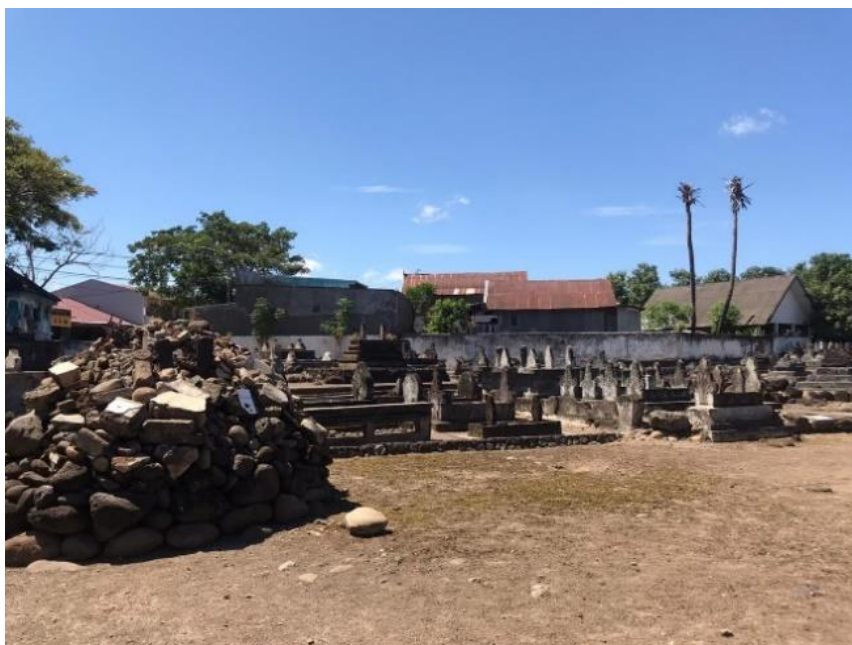
Figure 2. The Condition of La Tenri Ruwa Tomb Complex