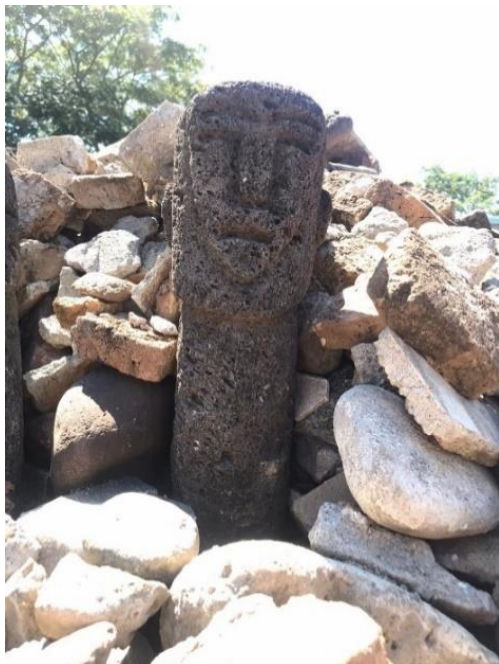
Figure 6. Double Chin Statue Tombstone in La Tenri Ruwa Tomb Complex

The round statue tombstone is about 50 cm in height and about 15 cm in width. On the face, there are lines that form eyes, lips, a nose, and eyebrows (Figure 4).