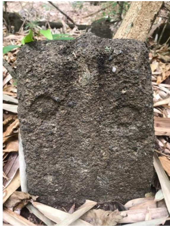
Figure 24. Statue Tombstone 4 in Matakko Islamic Tomb Complex

on its wide sides. These attributes are seen on the south side only (Figure 23).