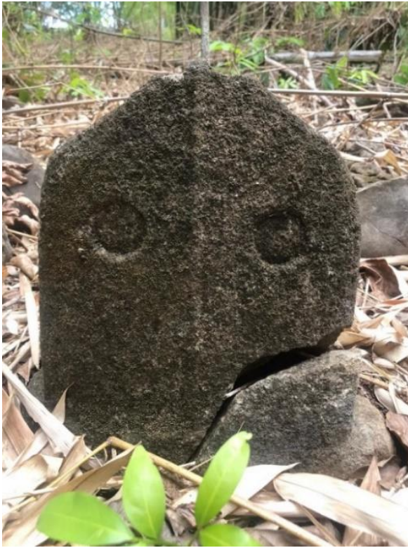
Figure 21. Statue Tombstone 1 in Matakko Islamic Tomb Complex