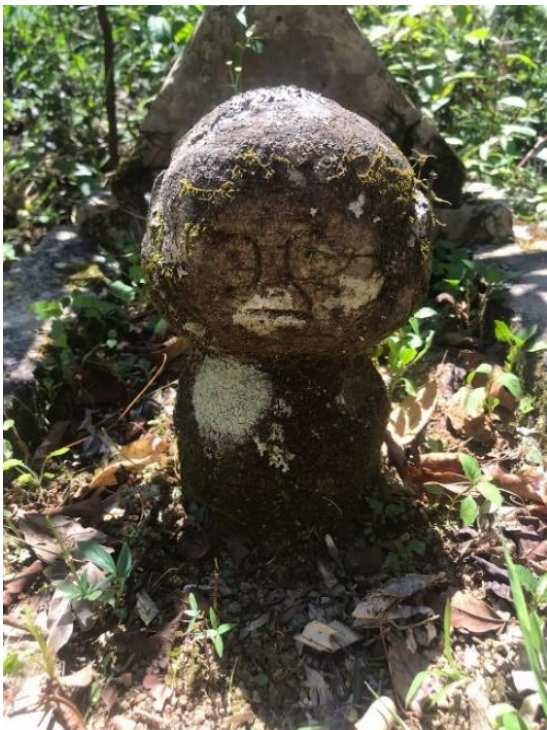
Figure 10. The Statue Tombstone in Lanynying Site

like a forest, is full of wild shrubs, and is very unkempt.